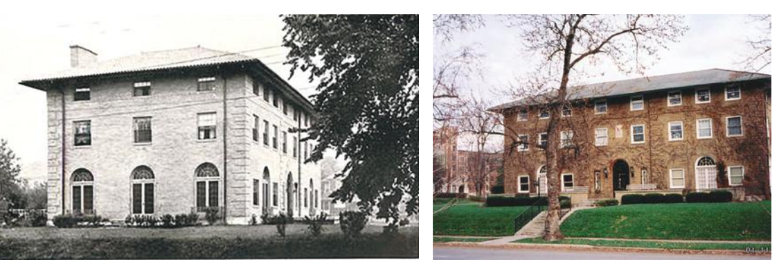
640 Russell Street: 1926 and now...

Times changed: The Great Depression, World War II, the US Navy V-12 program taking over