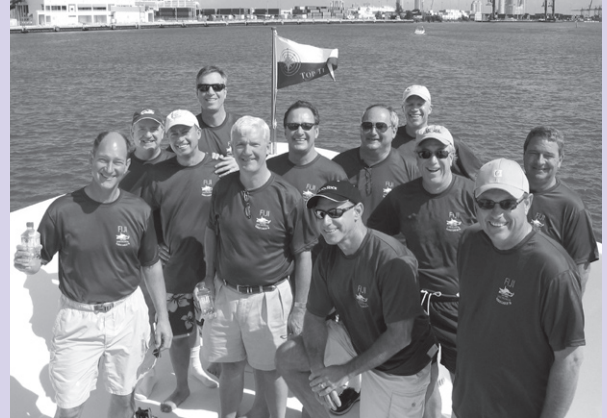
The Class of 1974 Lambda Iota at its annual reunion, this year the brothers gathered in Ft. Lauderdale.